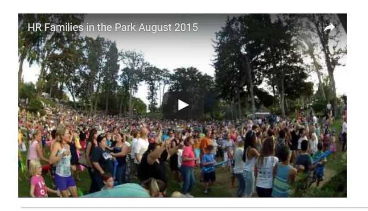
To Come Together